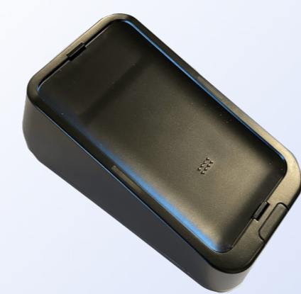
Charger stand with printer